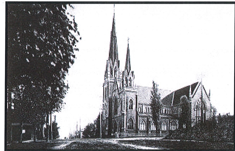
Holy Rosary Cathedral, Vancouver