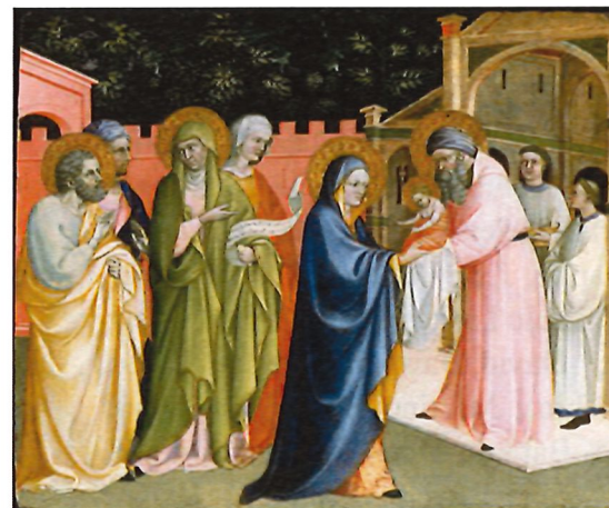
Presentation of the Lord in the Temple

We pray for women who are victims of violence, that they may be protected by society and have their sufferings considered and heeded.