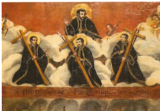
Saint Paul Miki and companions